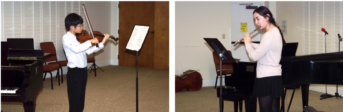
LA Branch JCMSSA at Villa Gardens