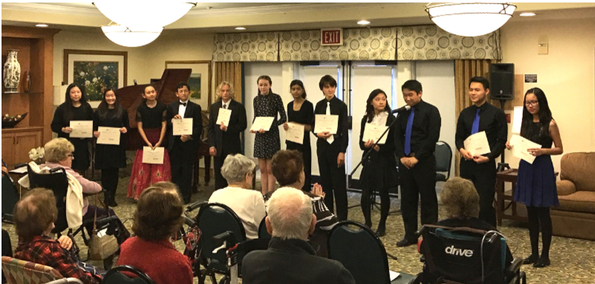
CV/SFV Branch JCMSSA at Atria Senior Living